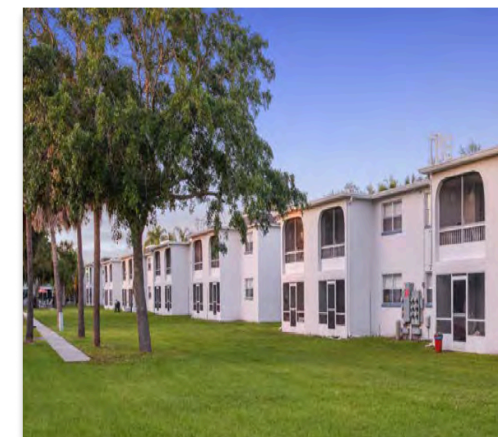
Value-Add Apartments - 2023 Tampa MSA Lead Investor