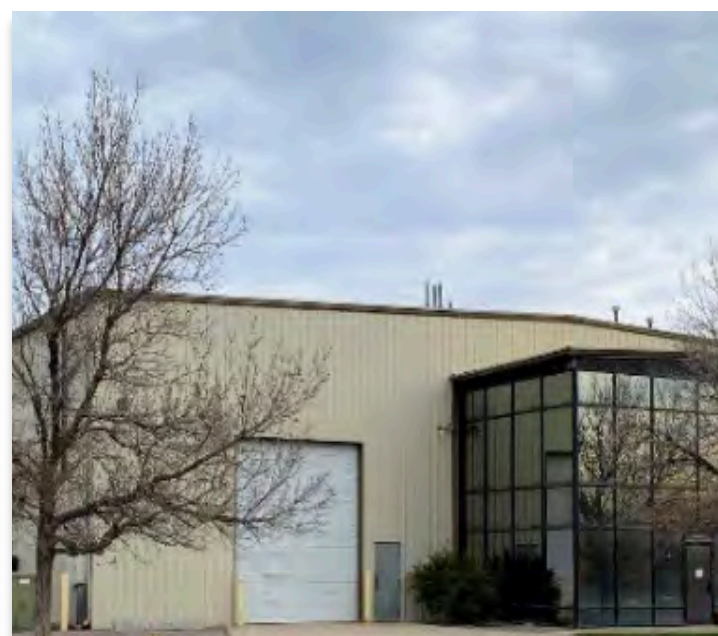
Value-Add Industrial - 2024 Denver MSA Sole LP + Co-GP Investor