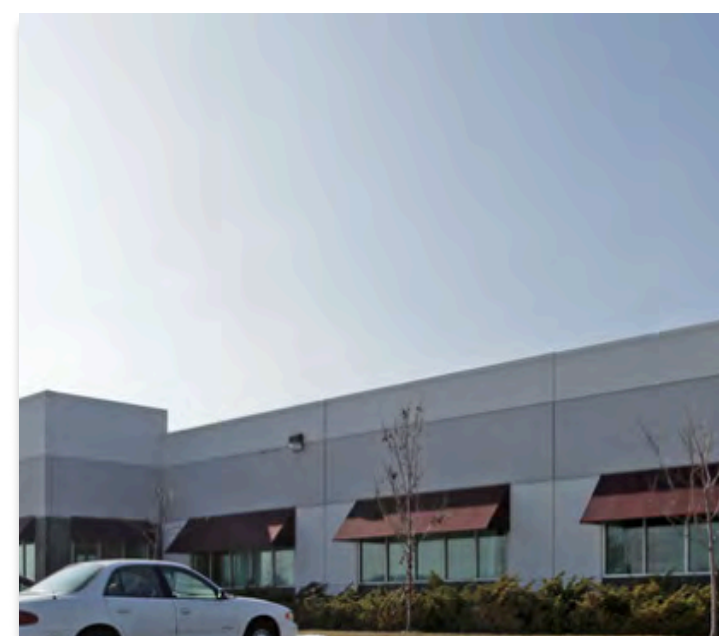
Value-Add Industrial - 2024 Salt Lake MSA Lead Investor