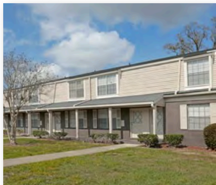
Value-Add Apartments - 2024 Jacksonville MSA Co-Lead Investor